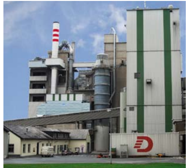
Reducing dust emissions with the CombiJet bag filter

At the reference plant, „Dyckerhoff AG, Geseke“, the existing electrostatic precipitator behind the rotary kiln was no longer able to comply with the legally specified limits. In order to ensure that future cement production could continue to keep within the limit values under any conditions, an optimised procedure was required for reducing dust emissions. A new filter housing for the bag filter installation was attached to the dust collection hopper of