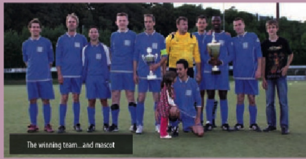
The winning team...and mascot